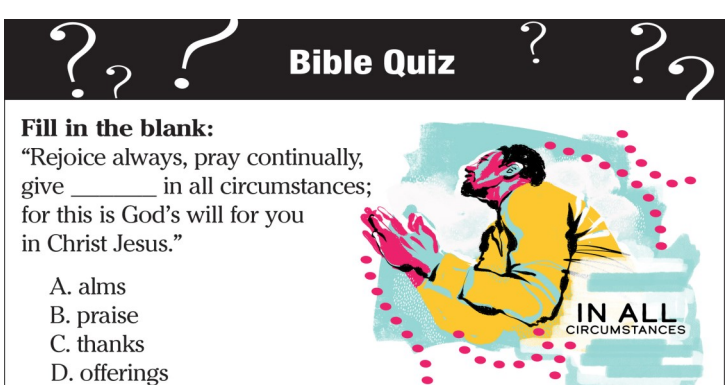
Answer: C (See 1 Thessalonians 5:16-18, MIV.)

Answers: Across 2. Satan, 4. stars, 6. Bildad, 8. Leviathan, 12. Eliphaz, 13. boils, 15. stheep; Down 1. Redeemer, 2. suffering, 3. Job, 4. sea, 5. rain, 7. donkeys, 9. Zophas, 10. camels, 11. Elihu, 12. oxen